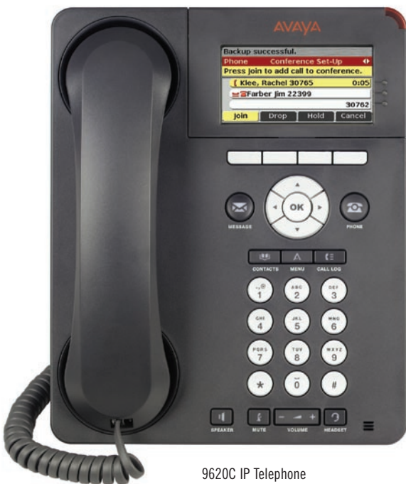
9620C IP Telephone

Session Initiation Protocol (SIP) is supported on many 9600 models. This enables the 9600 Series IP Telephones to support applications that can increase productivity. For example, the phone integrates with Microsoft Outlook's calendar and displays appointments – no need to boot up the computer to find out what the day's schedule looks like. In addition, 9600