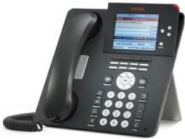
9650C IP Telephone