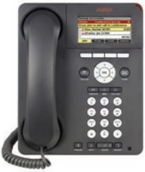
9620C IP Telephone