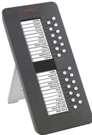
24 Button Expansion Module