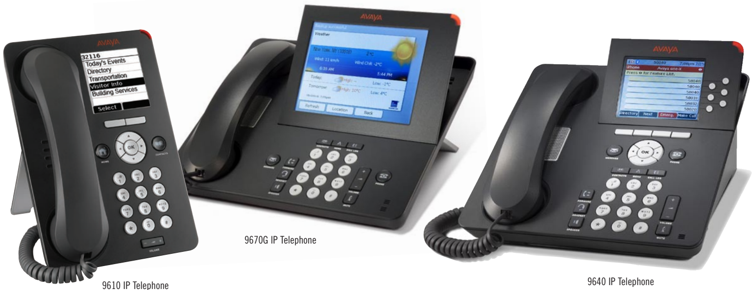
9610 IP Telephone

For the Navigator: the 9650 and Button Module. The Navigator also spends a great deal of time on the phone, largely handling calls for others. Receptionists and executive assistants are examples of Navigators. The 9650 provides one touch access to a great