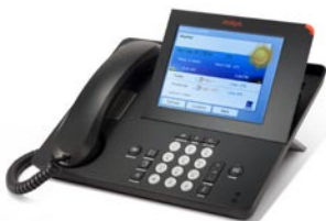
9670G IP Telephone