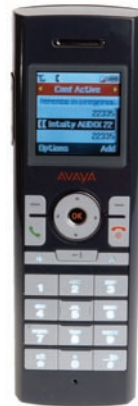
3631 Wireless IP Telephone

range of features and functions; it comes with an integrated button expansion module for quick access to features and people and super efficiency.